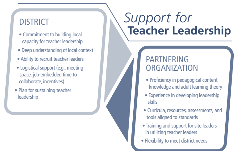
Figure 2. District–organization partnership: Contributions to support teacher leadership

In the case of building strong teacher leadership, partner organizations can help districts develop a coherent plan that includes defined teacher leadership roles and a systemwide structure for supporting the teacher leadership work. 6 Meanwhile, districts offer the historical and current knowledge of the sites, capability to implement new districtwide systems, and the authority to change or enact their local policy and practices. Figure 2 summarizes key contributions that need to be made by the district and by the partnering organization in order to collaborate effectively to support teacher leadership.